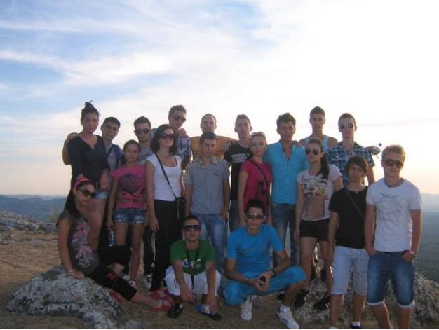
Climbing La pena, Martos